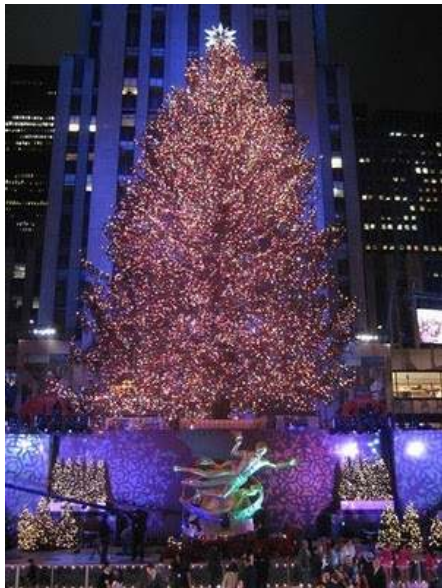
Rockefeller Center - Prometheus under the Christmas Tree

Have you ever seen a more congenial picture of Satan? Actually, you probably have, if you recognize what is depicted in the following image: