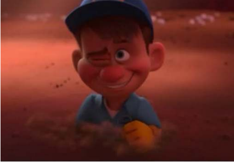
Ooohh! Your Eye!

(An occult symbol for the one-eyed messiah)