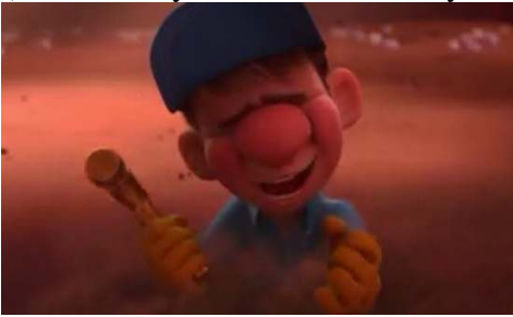
Struck Twice - Nose

(An occult symbol for the one-eyed messiah)