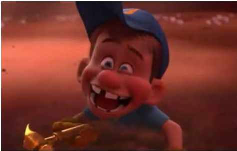
Struck Thrice - Teeth