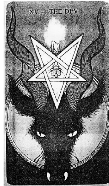
Goat Head of Mendes

L'enfant, the French Mason, laid out within the street plan of Washington DC numerous Masonic symbols. You can observe here both the compass and the square of Freemasonry, as well as the five pointed star which is prominently depicted in the Order of the Eastern Star.