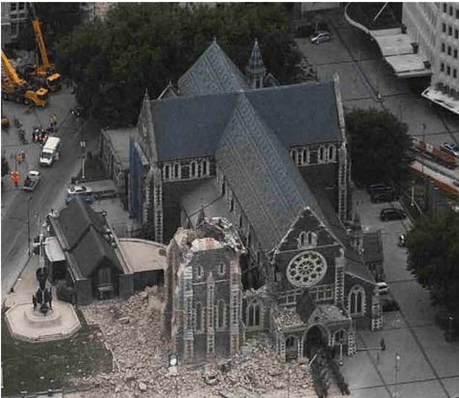
Christ Church Cathedral - Bell Tower Destroyed