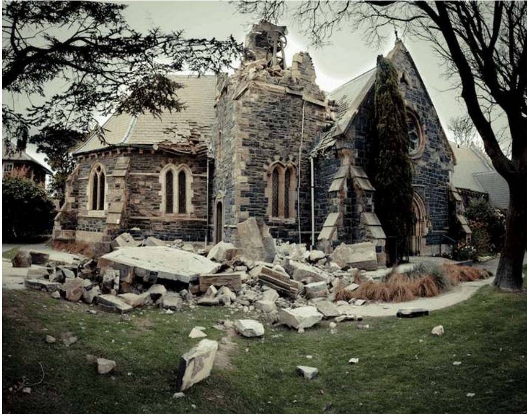
St. John's Anglican Church Bell Tower Destroyed

I want to mention a singular phenomena that occurred when the earthquake struck Christchurch, New Zealand this week. In instance after instance, the bell towers collapsed on prominent churches, some of which were historic landmarks.