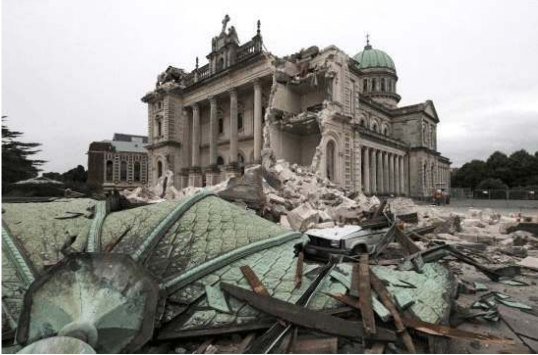
Christchurch Basilica (Roman Catholic) - Both Bell Towers Destroyed