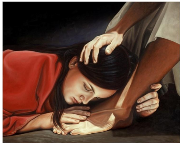
Yahshua and Prostitute

"It is not those who are healthy who need a physician, but those who are sick. But go and learn what this means, 'I desire compassion, and not sacrifice,' for I did not come to call the righteous, but sinners."