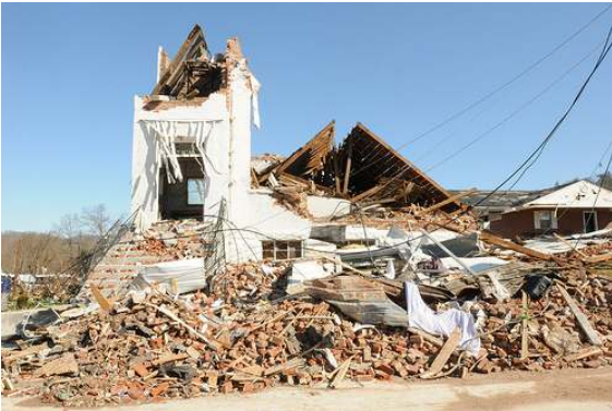
West Liberty UMC After Tornado

This expression, “those who suffer according to the will of God” does not speak only of those who encounter persecution due to obedience in following Christ. It is also a reference to those who are chastened by God that they might learn to walk in holiness. In either case, we are exhorted to trust God to do what is best and needful toward us, for He is a faithful Creator.