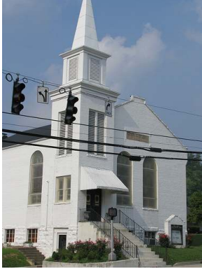
West Liberty United Methodist Church Before Tornado