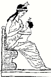
EGYPTIAN GODDESS ISIS AND SON HORUS