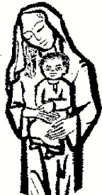
ROMAN CATHOLIC MARY AND GOD-INCARNATE JESUS