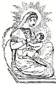
INDIAN GODDESS DEVKA AND INFANT KRISHNA