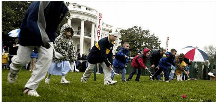
Egg Roll on White House Lawn, Easter 2006

The mystery religions teach that Semiramis was herself immaculately conceived and was lowered from the heavens to the earth in a giant egg. This egg came to rest in the waters of the Euphrates river. Eggs are also symbols of fertility, and as Semiramis was also a fertility goddess the symbol of the egg became thoroughly associated with her worship. Those who knew Semiramis under the name of Ishtar spoke of Ishtar's egg, from which we get our current Easter egg.