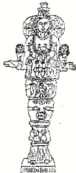
GODDESS DIANA OF EPHEBUS