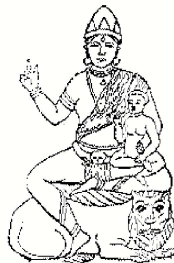
INDIAN GODDESS ISI AND INFANT ISVARA