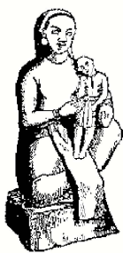
BABYLONIAN GODDESS SEMIRAMIS AND GOD-INCARNATE SON

I hope that the Christian today can understand that Yahweh will certainly use the same standard of measure when He chooses those who will be numbered among the overcomers, and who will be granted access to His presence and to His most holy things. That He will make a division among the saints based upon their involvement in idolatrous practices is prophesied in Ezekiel 44:6-19.