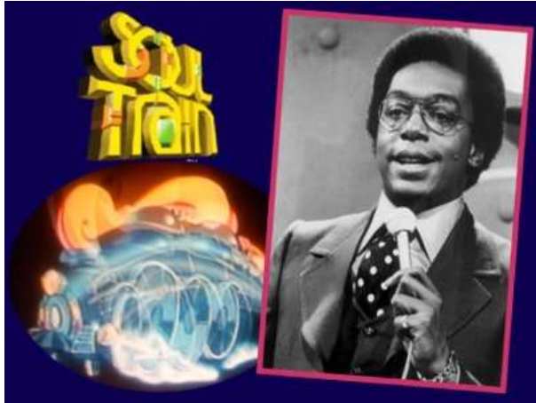
Don Cornelius - Soul Train September 27, 1936 – February 1, 2012

The year 2012 has opened with the deaths of two men who stood as symbols of the American Music scene. On February 1 st Don Cornelius, founder and longtime host of Soul Train, was found dead of a self-inflicted gunshot. He had been in much pain and suffering for years due to physical infirmities.