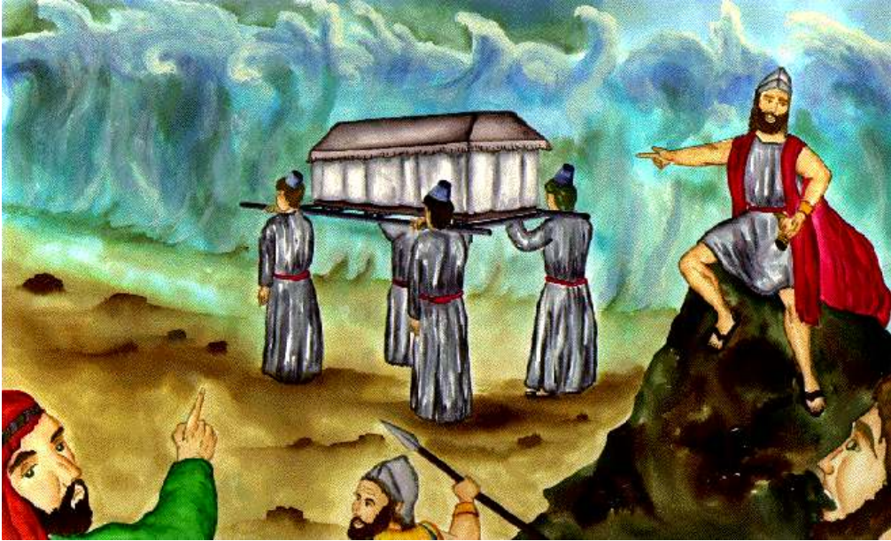
(Slide - Joshua Crossing Jordan)

The parallels between the life of Joshua and the life of Yahshua, the Son of God, are not coincidental. They were ordained by God to teach us many profound lessons. Not only do they share the same Hebrew name, but many similarities exist between their lives.