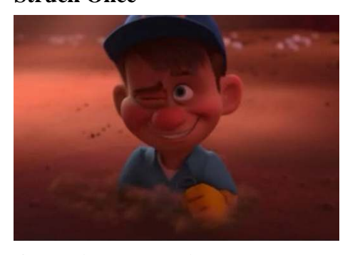
Ooohh! Your Eye! (An occult symbol for the one-eyed messiah)