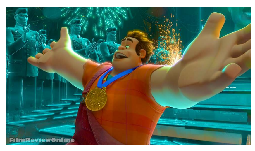
Wreck-It Ralph Dreaming of Being Worshiped as a Hero

What this movie presents is a type of Satanic revisionist history. Satan would like to re-cast himself as a good-guy, a heroic figure who has mankind's best interests at heart. Toward the end of the movie we see Ralph/Satan hauled high into the sky by an evil bug. Ralph knows that to fall from that height will bring about his demise, yet he must do so to save Vanellope and the rest of the arcade. He chooses to cast himself down to save others.