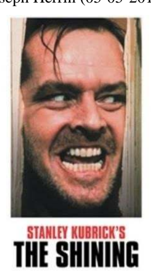
Advertisement for The Shining

There is some recognition, although limited, among Christians, that Hollywood spreads Satanic messages through both overt and covert means. Subliminal messages are infused throughout movies and television, rendering the watching of this Luciferian media a hazard to all, and calling for great caution. The recent documentary Room 237 explores the subliminal messages contained in the Stanley Kubrick film The Shining . The documentary reveals the subtle means through which Hollywood movies both reveal and conceal dark and enigmatic messages.