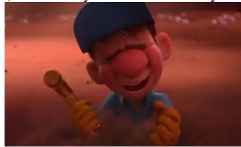
Struck Twice - Nose