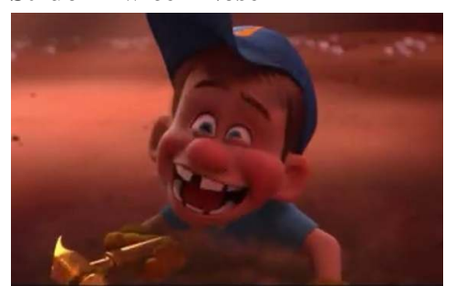
Struck Thrice - Teeth