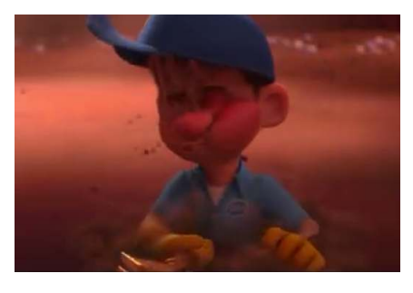
Fourth and Fifth Strike