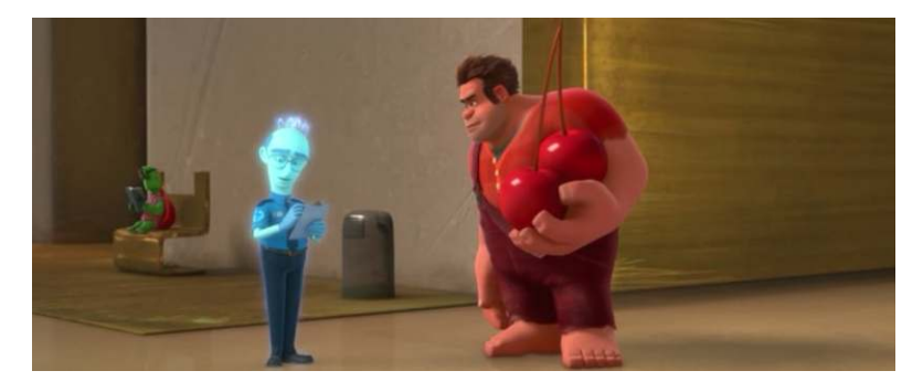
Wreck-it Ralph at Security Check

At the surge suppressor security check, Ralph is asked whether he has brought any fruit with him. He lies, and hides the fruit behind his back. He then gives the forbidden fruit to others in what appears to be a benevolent act.