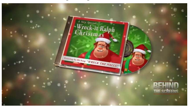
Wreck-It Ralph - His Own Christmas Album

In case you don't understand why the Rockefellers erect a huge Christmas tree above the statue of Prometheus every year, Prometheus is a symbol of Satan as a benevolent gift giver, bringing to mankind that which the gods (Yahweh) forbid. The fire in Prometheus' hand is under the tree right where gifts are typically laid. The Christmas tree is a pagan symbol initiated by Satan. The star at the top of the tree symbolizes Lucifer, the Morning Star, who was cast down from heaven. Did you note the following image from the short video above?