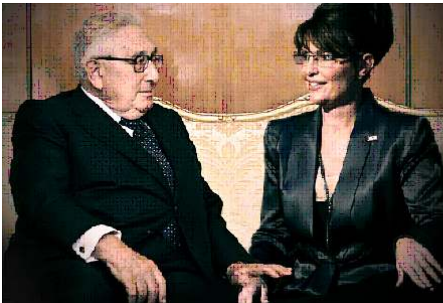
Henry Kissinger - Sarah Palin Interview

[Source: Henry Kissinger, World Affairs Council Press Conference, Regent Beverly Wilshire Hotel, April 19th 1994]