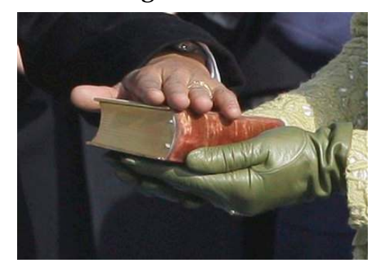
Obama's Hand on Lincoln's Bible

During the inauguration of the 44<sup>th</sup> President of the United States many details of great prophetic significance were observed. None were less prefigurative of those things to come to the nation than Barack Obama taking his oath of office with his hand upon the same Bible used by Abraham Lincoln in his inauguration.