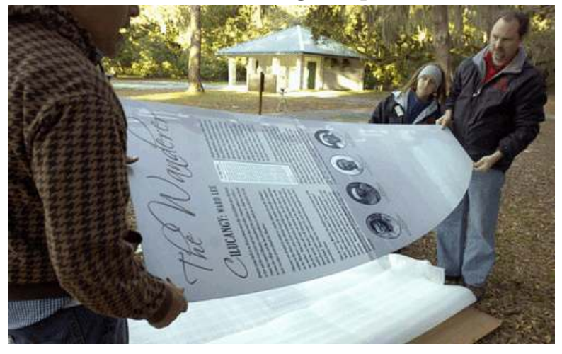
The Wanderer was a ship built under the guise of being a pleasure yacht. The

I mentioned in yesterday's post about an excursion I had on my bicycle down to the south end of Jekyll Island. At the St. Andrews Picnic Area there is a new display that relates the history of a ship known as The Wanderer , and its nefarious connection to Jekyll Island. The display was erected last year on November 25<sup>th</sup>. Following is a photo taken during its erection.