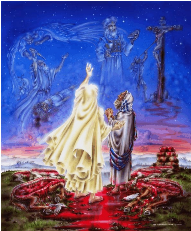
God's Covenant with Abraham

And [Abraham] said, "O Yahweh God, how may I know that I shall possess it?" So He said to him, "Bring Me a three year old heifer, and a three year old female goat, and a three year old ram, and a turtledove, and a young pigeon." Then he brought all these to Him and cut them in two, and laid each half opposite the other; but he did not cut the birds. Now when the sun was going down, a deep sleep fell upon Abram; and behold, terror and great darkness fell upon him... And it came about when the sun had set, that it was very dark, and behold, there appeared a smoking oven and a flaming torch which passed between these pieces. On that day Yahweh made a covenant with Abram.