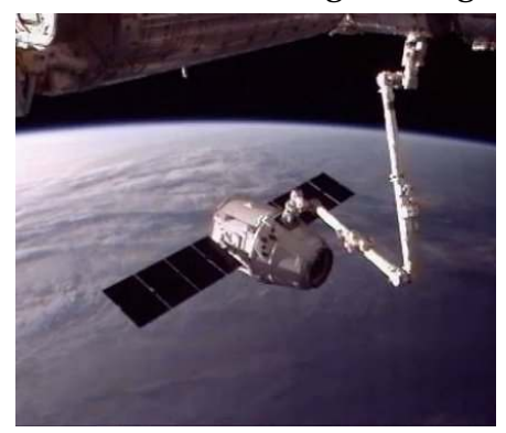
Dragon Capsule Captured by ISS

NASA ended the Space Shuttle program after several decades of service and is now looking to outsource the delivery of material and personnel to the International Space Station. Spacex's Dragon Capsule was the first privately developed vessel to ever be utilized in this manner. It has garnered great media attention. Those who are seeking to understand the times we live in can gain insight through what is symbolized.