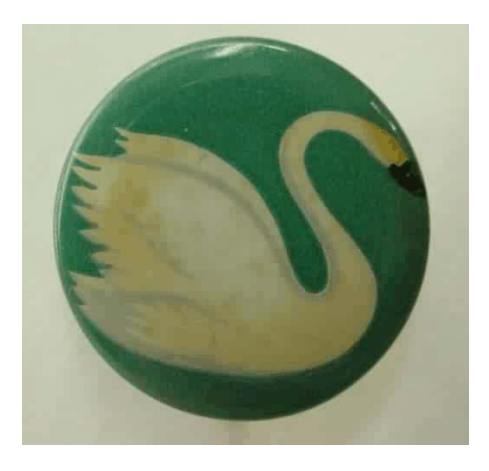
Swan Soap Logo

This message of Christ coming to cleanse His bride is reinforced in the name that describes this Nebula. It is called "the Soap Bubble Nebula." Soap and swans are not an unusual association, for swans are a symbol of that which is pure and clean, and their down is prized for its softness.