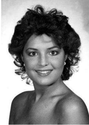
Sarah Palin - Miss Wasilla (1984)