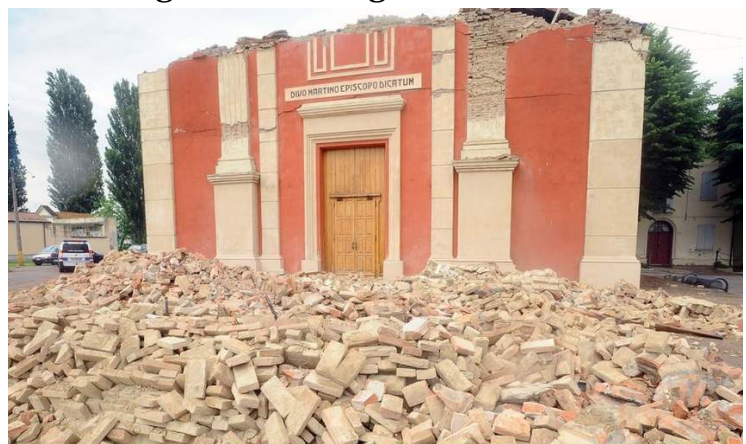
Church Destroyed in Italy Earthquake

Even as in the previous year there was a link between earthquakes and the ring of fire, the two main news stories yesterday were the Ring of Fire eclipse and a destructive earthquake in Italy. The earthquake in Italy is reported to be the strongest in the region since the 1300s.