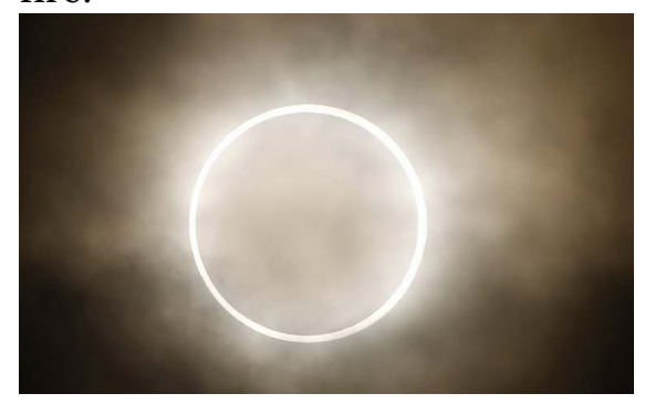
Ring of Fire Solar Eclipse

I am going to repeat some of that article here as the Father is once again bringing forth a testimony of what is soon to occur. All the major news venues emphasized the rare annular solar eclipse that occurred yesterday (SUNday). Over and over, those in the media were referring to this eclipse as a "ring of fire."