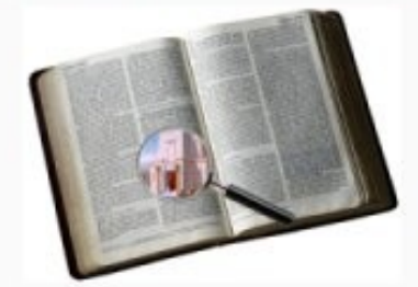
Bringing hidden things to light...