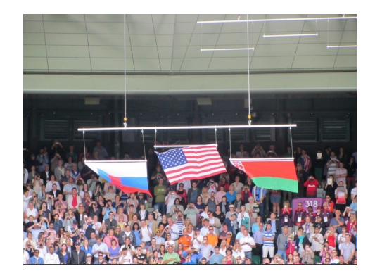
The Fall is Near

In the past few days I have had about half a dozen readers of this blog send me links to a similar testimony that occurred at the Olympics in London this week. I am encouraged that so many are discerning these parables for themselves. During the medal ceremony for women's tennis as the national anthem for America was being played, the U.S. flag came loose and fell to the ground.