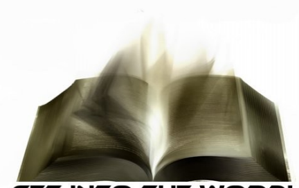
GET INTO THE WORD!

Did you know the original King James Bible included 15 books that are no longer found in KJV Bibles today? These books were held in a section by themselves, apart from the Old Testament and New Testament. This section was titled "Apocrypha."