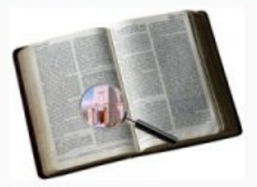
Bringing hidden things to light...