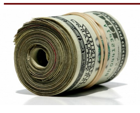
"Money is the root of all evil."

The above phrase is one of the most popular misquotations of the Bible today. People say this all the time, believing it is stated in Scripture. The Bible contains an expression that is similar to this, but it varies in significant ways.