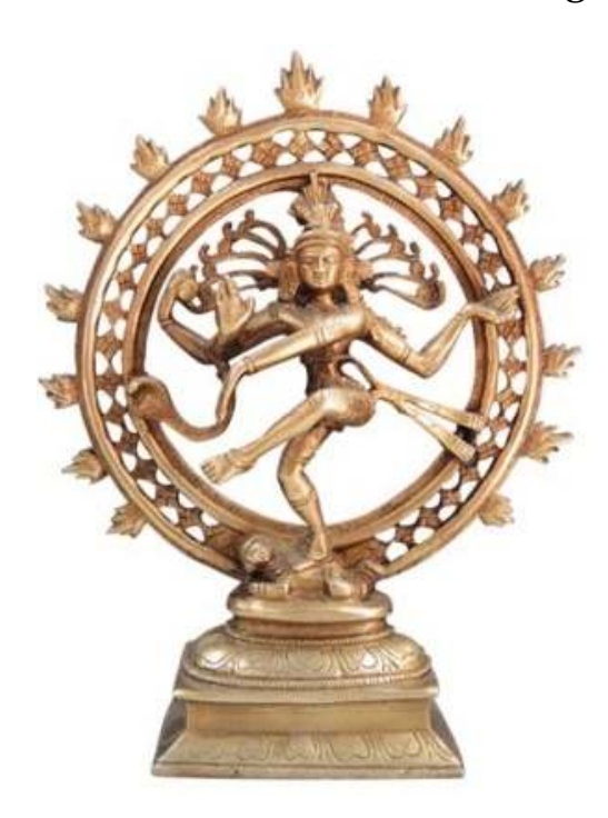
Shiva - The Destroyer

Pictured below is the demon god Shiva performing the dance of death.