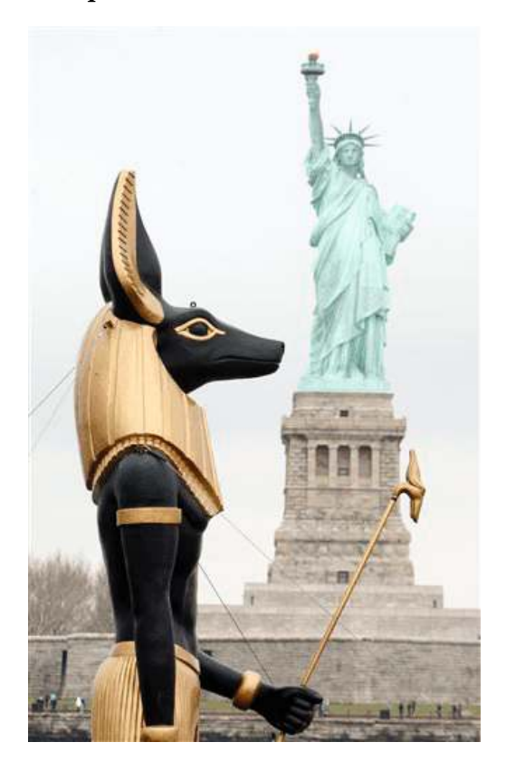
Liberty's Appointment with Anubis

We live in truly historic times. Those who live in the United States are witnessing the end of a nation whose founding fathers promised "life, liberty and the pursuit of happiness." The great experiment to see whether a free people could govern themselves has come to an inglorious end.