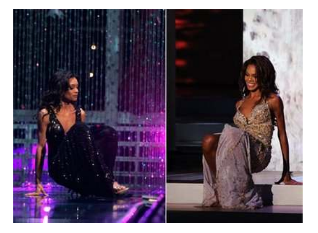
Miss USA 2007/2008

In 2007 and 2008 Yahweh gave a profound witness of the fall of America. During the Miss Universe Pageant both years, the young woman representing America fell on stage during the evening gown portion of the competition.