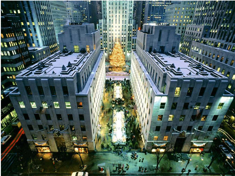
Rockefeller Center Christmas Tree

Look at the following view of the Christmas tree at Rockefeller center.