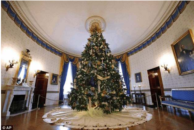
White House Christmas Tree

http://www.dailymail.co.uk/news/article-1336470/Obamas-Christmas-tree-takes-4-days-height-economic-crisis.html