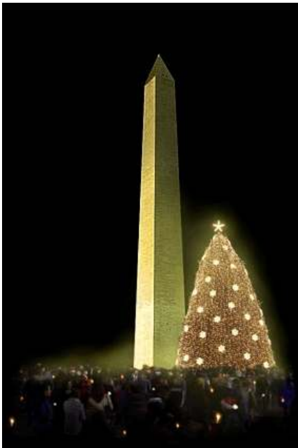
Christmas Tree and Washington Monument - World's Largest Obelisk

The Christmas tree is a form of obelisk. The following pictures will reveal this better than any other argument I could present.