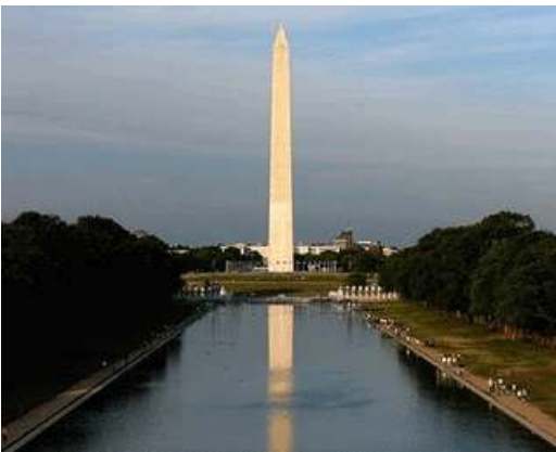
Washington Monument and Reflecting Pool

Does this bring to memory images of the Washington Monument at the end of the Reflecting Pool?