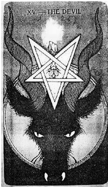
Goat Head of Mendes

The inverted five pointed star is an occult image known as the Goat Head of Mendes. It is a symbol of the devil.