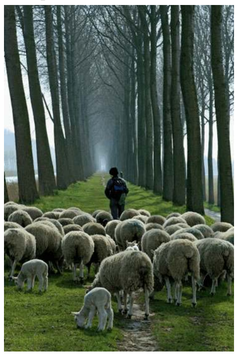
Luke 12:32 "Do not be afraid, little flock , for your Father has chosen gladly to give you the kingdom."

I love the above picture. There is a shepherd going before the sheep (staff in hand). There is a straight and narrow path. There is also a little flock .